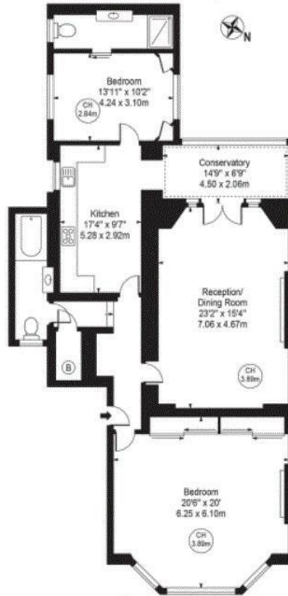
Ground Floor For Illustration Purposes Only - Not To Scale

This floor plan should be used as a general outline for guidance only and does not constitute in whole or in part an offer or contract. Any intending purchaser or lessee should satisfy themselves by inspection, searches, enquiries and full survey as to the correctness of each statement. Any areas, measurements or distances quoted are approximate and should not be used to value a property or be the basis of any sale or let.